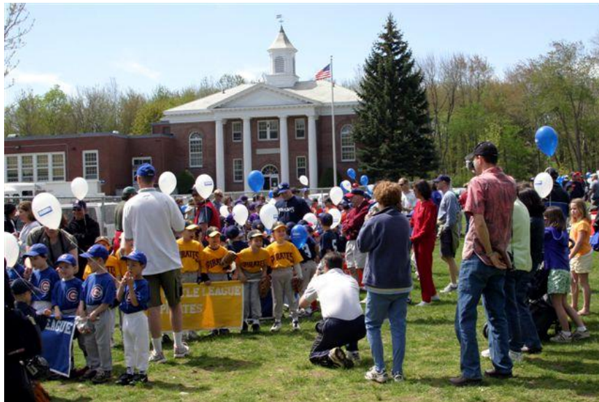
Bolton Little League Parade

Bolton has a very active and vocal community that is interested in the issues addressed in this Master Plan. As noted above, the town survey of 2002 received a 42% response rate, which indicates the high level of concern that residents place on quality of life and the decisions that the Town makes. This plan was created with thoughtful consideration by the Master Plan Committee as they sought to gain a comprehensive understanding of the townspeople's opinions. To that end, the committee invited members from various town boards and organizations to discuss their main concerns at their weekly meetings. Town Boards and Committees had an opportunity to review and comment on the plan before publication. They also submitted commentary in local newspapers and held two public forums to give residents the opportunity to listen to ideas about the town's future and provide feedback. The MPC hopes the end result is a plan that represents the full input of the community at large.