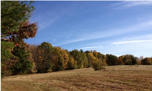
4 NORTH MEADOW LOOKING SOUTH TOWARD PARKING LOT