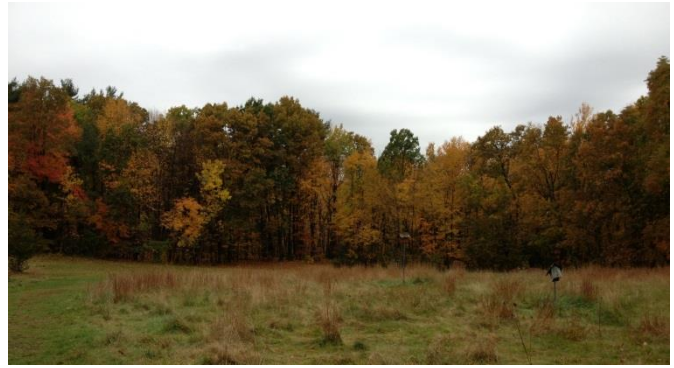
5 SOUTH MEADOW ENTRANCE (PARKING BEHIND YOU)