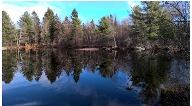
2 UPPER POND VIEWED FROM TRAIL BETWEEN PONDS