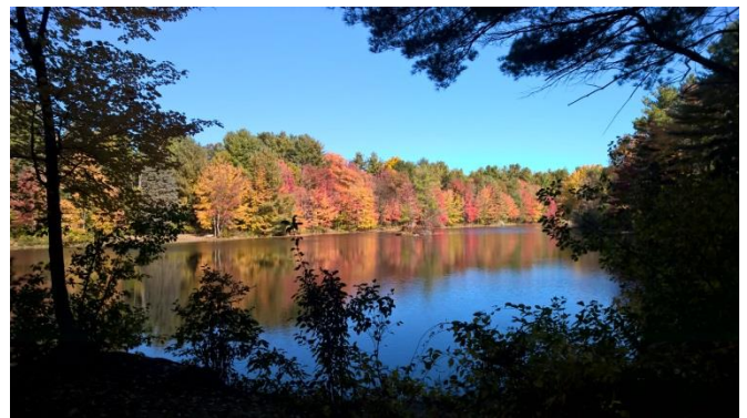
3 VIEW FROM LOWER POND LOOKING NORTH