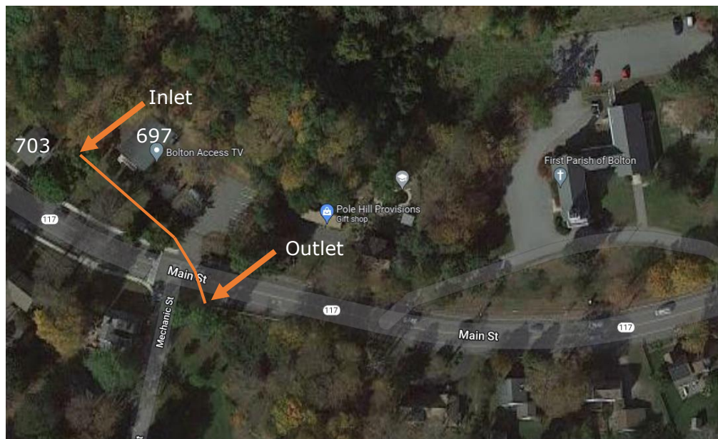
Figure 1 - Culvert Site

This field report presents our review of the condition of the culvert and retaining wall based on limited site observations and photographic documentation.