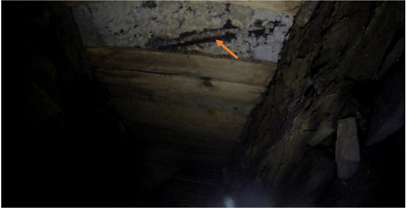
Photo 7: Exposed Rebar in Concrete Slab supporting roadway (GoPro stillframe image)