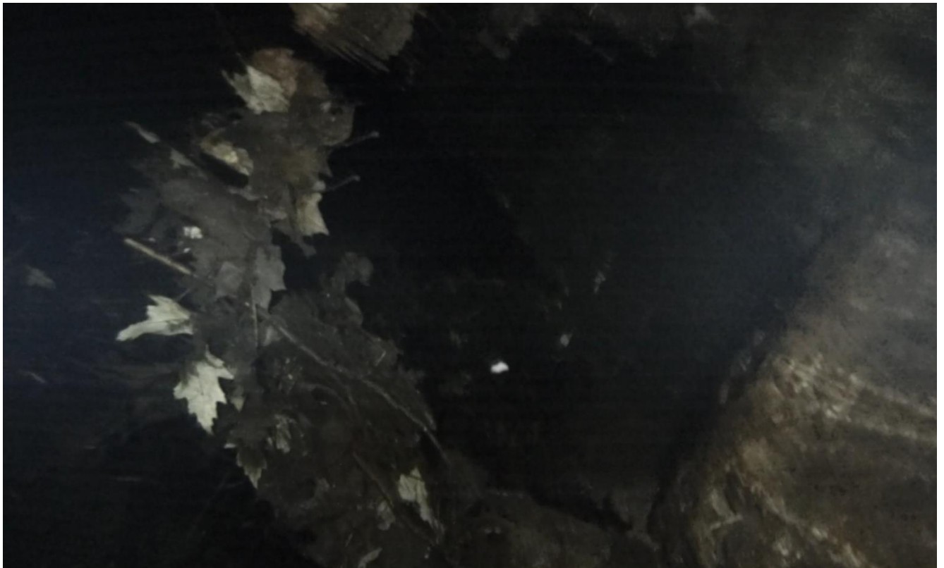
Photo 8: Branches and Debris at Culvert Bend (ROV stillframe image)