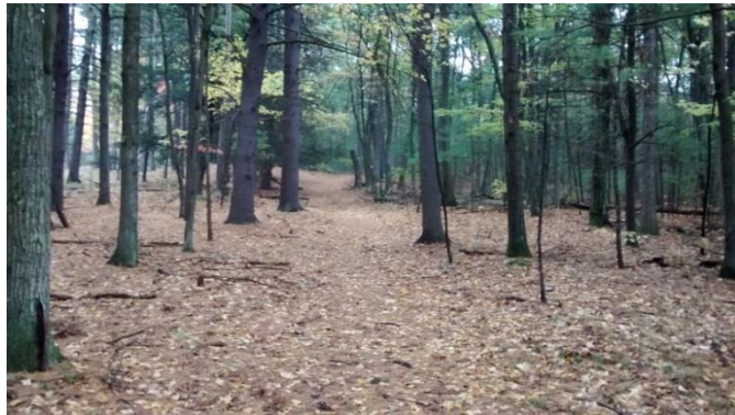
5 WOODLAND FOREST – TRAIL CONTINUES THROUGH