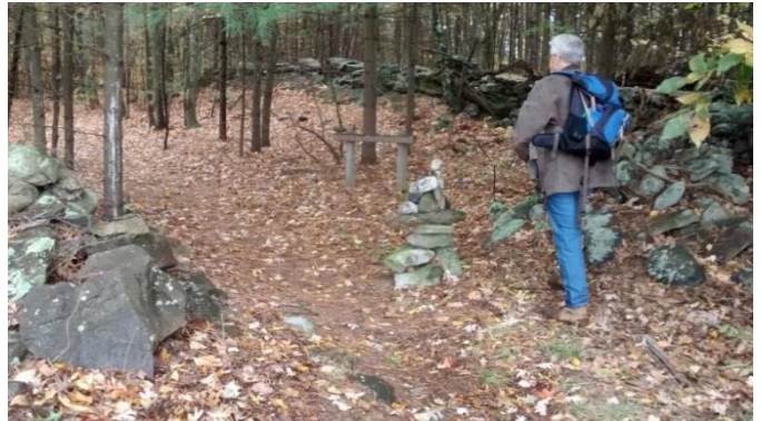
6 PHILBIN-SALMON TRAIL ENTRANCE - W. BERLIN ROAD (NO PARKING)