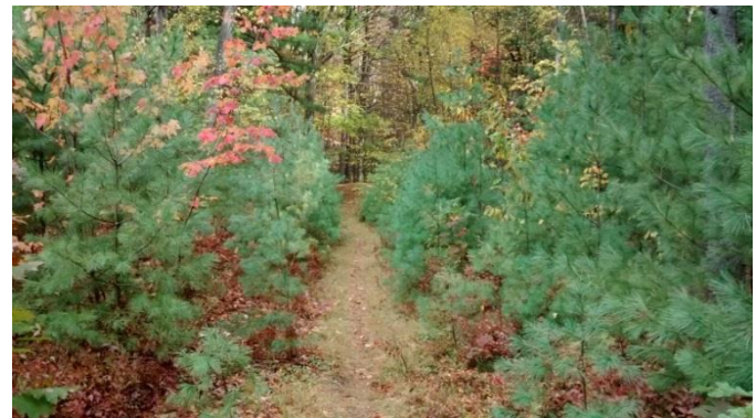
4 PINE GROVE – TRAIL CONTINUES THROUGH