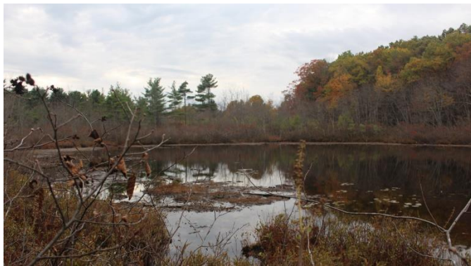
3 WELCH POND END OF TRAIL VIEW