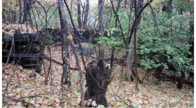
2 OLD STONE FOUNDATION (OVERGROWN)