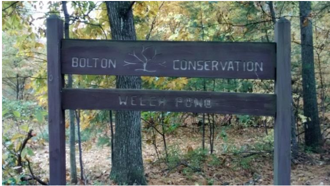
1 PARKING LOT OFF RT 117 (WATAQUADOCK HILL RD)