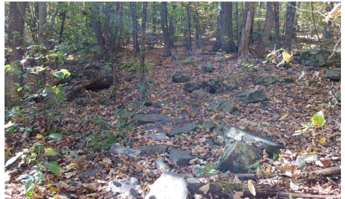
2 ROCK WALKWAY BRIDGE ON TRAIL