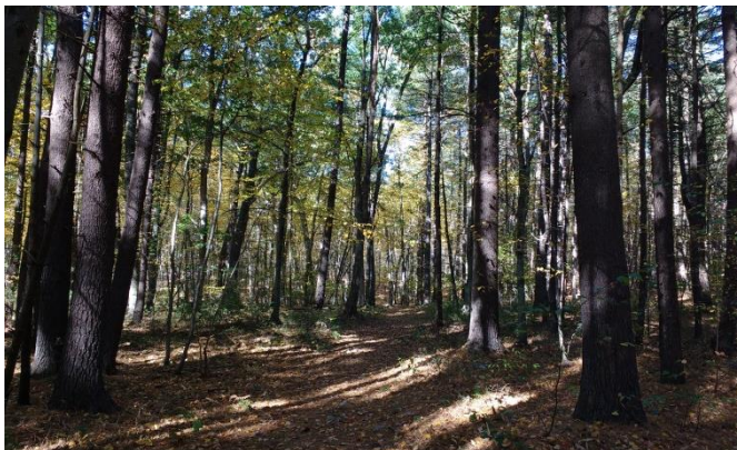
5 CENTER PROPERTY CART PATH (NORTHBOUND)