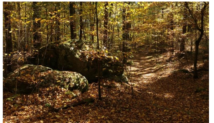
4 BOULDER AT TRAIL AND CART PATH INTERSECTION