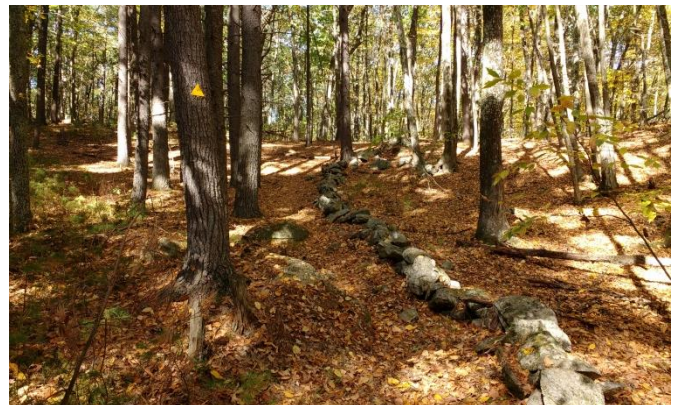
6 PRIMARY TRAIL NORTH ALONG STONE WALL