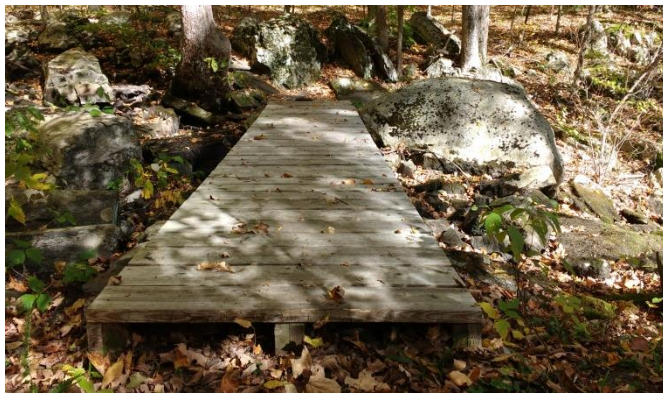
3 BRIDGE OVER GREAT BROOK