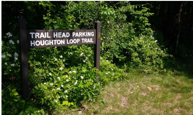
1 PARKING AREA