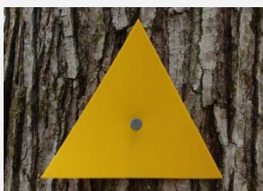
TRAIL MARKERS (TYPICAL)