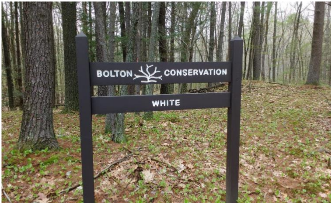
1 PROPERTY SIGN – TRAIL HEADS TO THE LEFT & RIGHT