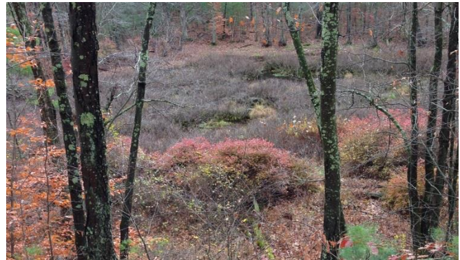
6 VERNAL POOL VISTA OVERLOOK (AUTUMN)