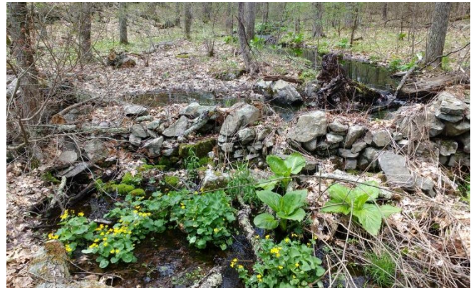
2 STREAM VIEW FROM RANDALL ROAD