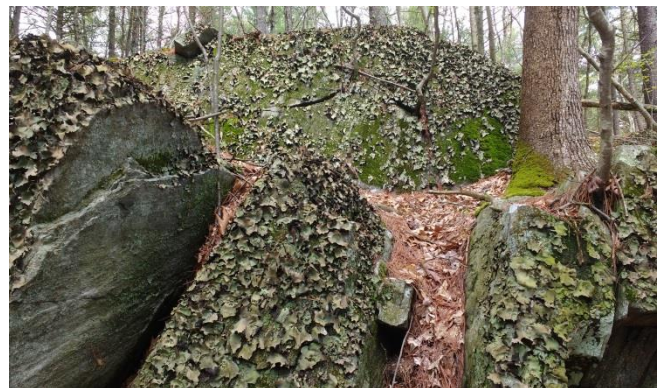
4 LICHEN BASIN ROCK FORMATION