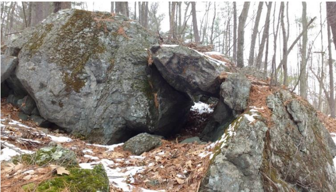
5 THE CAVE