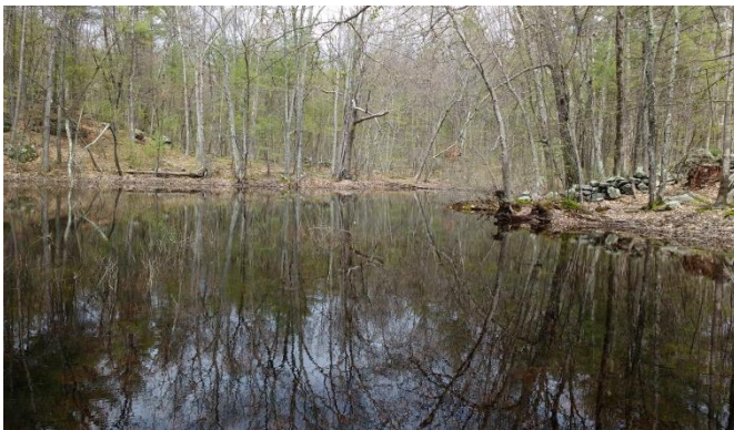
3 TRAIL WALK ADJACENT TO VERNAL POOL