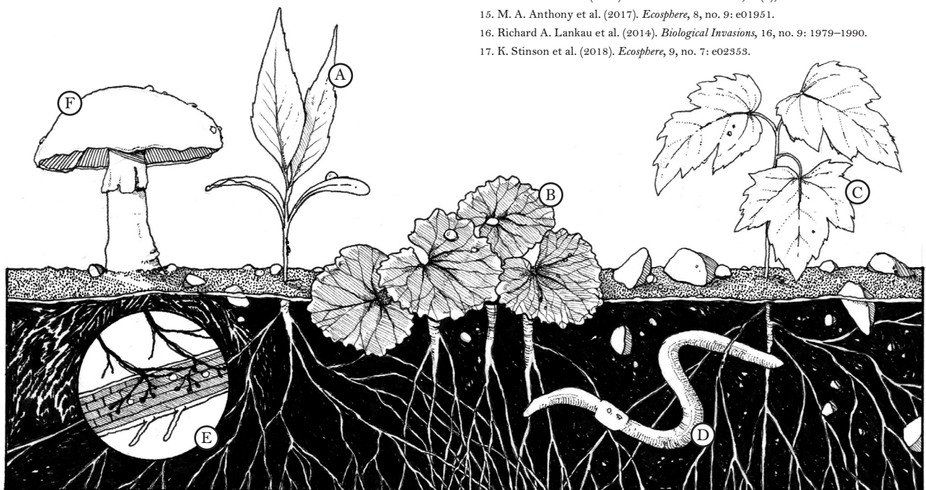
A. Ash ( Fraxinus americana ) seedling. B. Garlic mustard rosettes (first-year plants). C. Red maple ( Acer rubrum ) seedling. D. Non-native earthworm. E. Magnified ash seedling root and symbiotic mycorrhizal fungi interaction: fungal hyphae integrating into root through root hairs and forming arbuscules. F. Mycorrhizal fungus ( Amanita muscaria var. guessowii ).