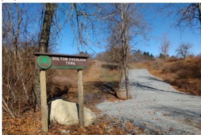
4 PROPERTY SIGN AND PARKING AT WATTAQUADOCK HILL