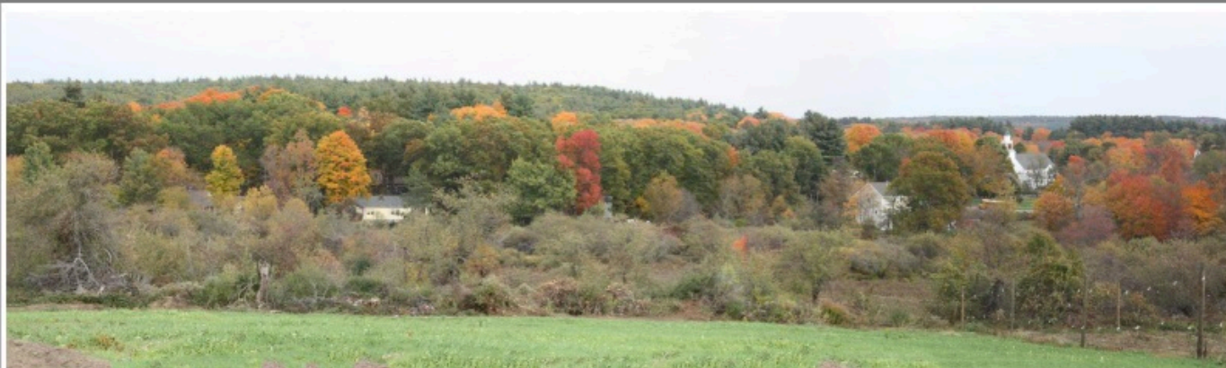
1 AUTUMN PANORAMIC VIEW EAST FROM BOLTON OVERLOOK