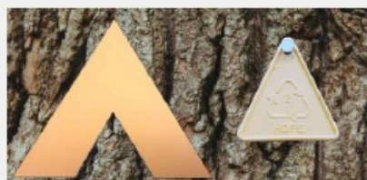
TRAIL MARKERS VARY