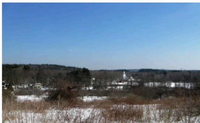
2 WINTER VIEW EAST FROM BOLTON OVERLOOK