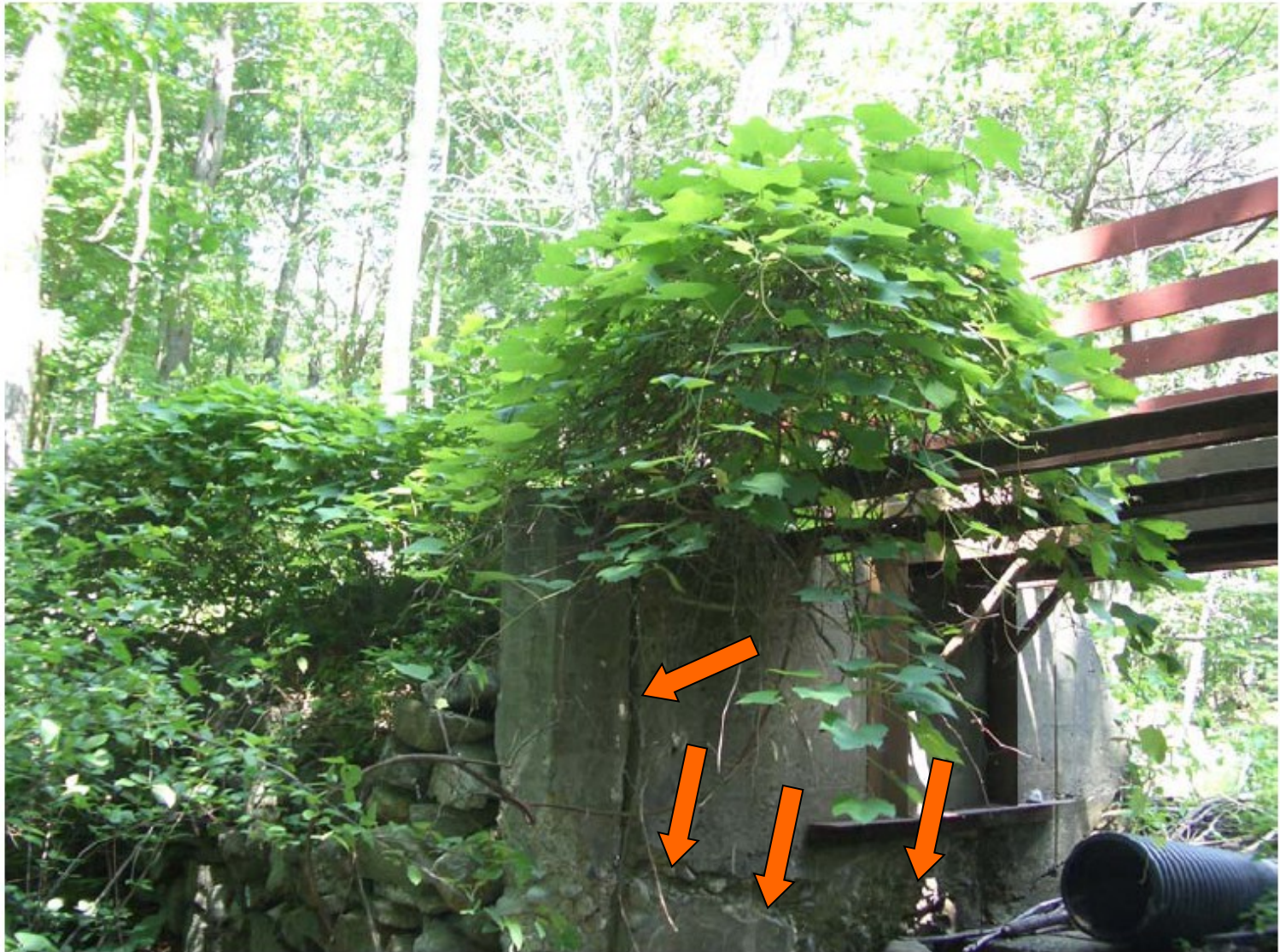
Photo #19: Downstream of spillway facing the right (west) spillway wall and dam wall with grape vine