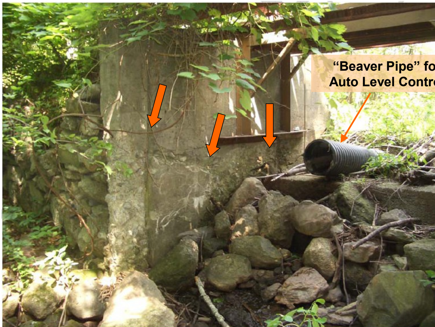
Photo #18: Downstream of spillway facing the right (west) spillway wall and dam wall