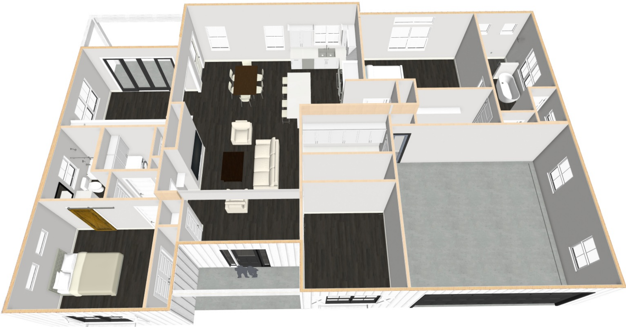
FLOOR OVERVIEW SCALE: