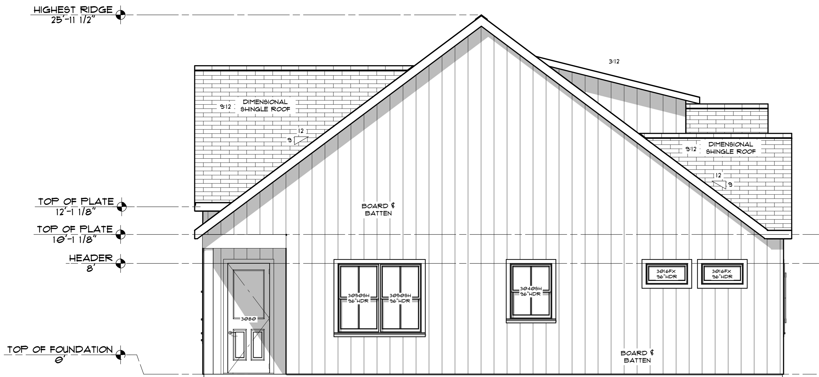
WEST ELEVATION SCALE: 1/4" = 1'-0"