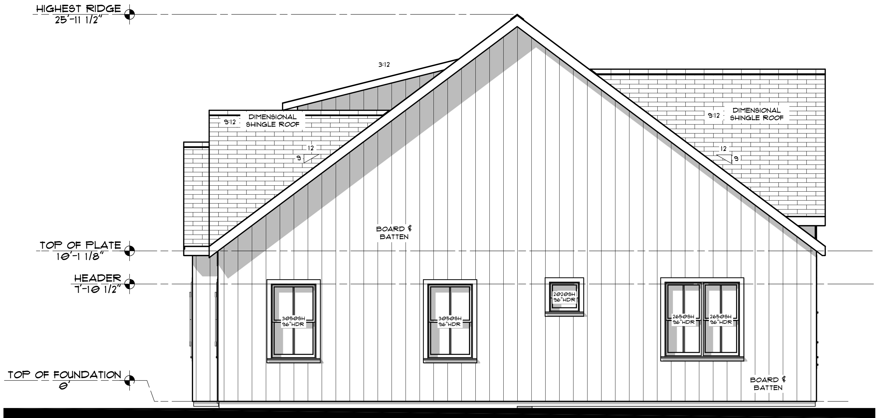
EAST ELEVATION SCALE: 1/4" = 1'-0"