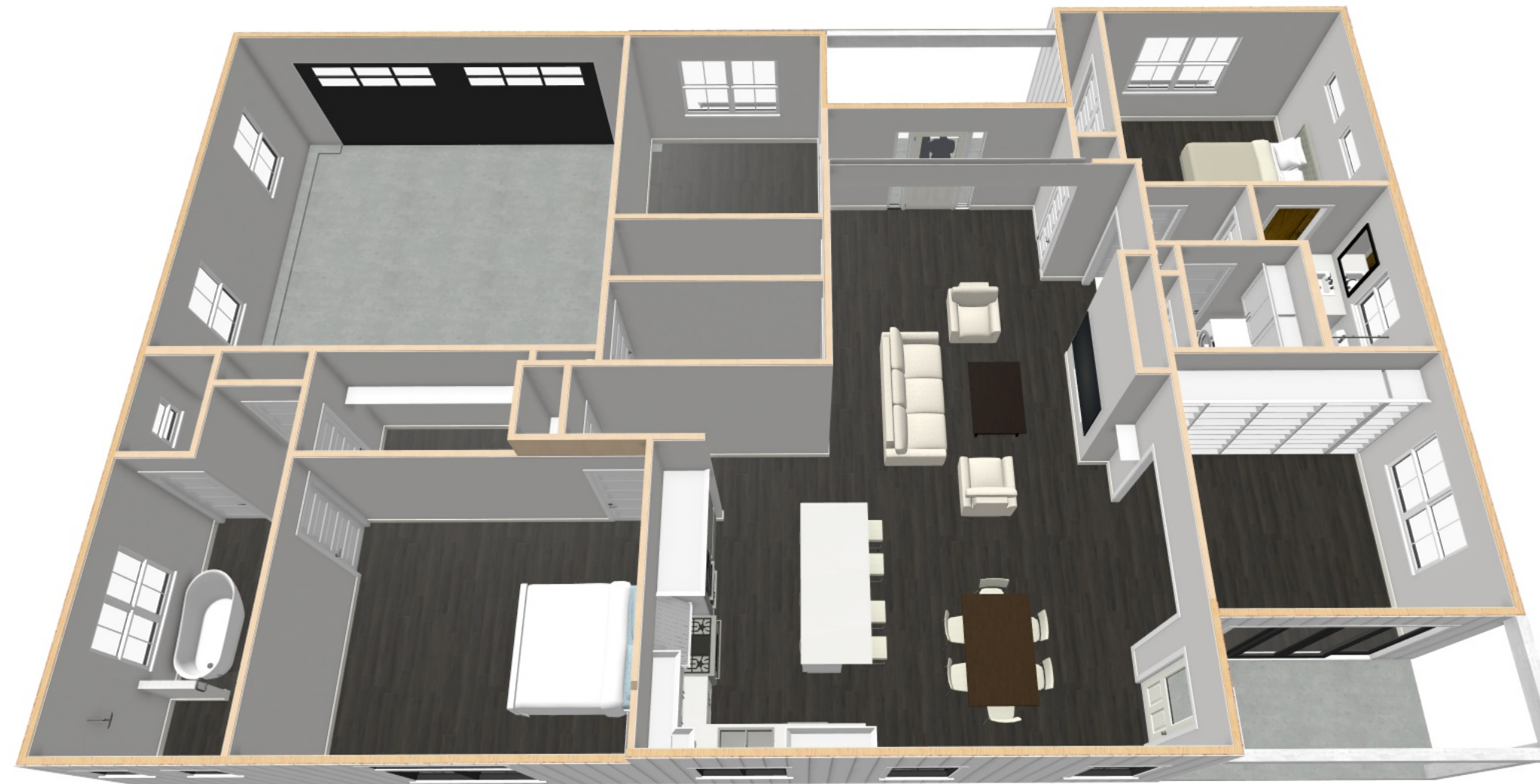
FLOOR OVERVIEW SCALE: